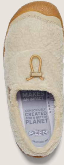
Women's Howser III Slide | $100 Moco Safari