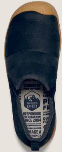
Men's Howser Harvest | $125 Black