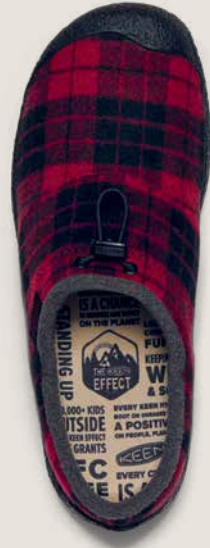
Men's Howser III Slide | $100 Rhubarb Plaid/Black