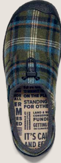
Men's Howser III Slide | $100 Green Plaid/Black