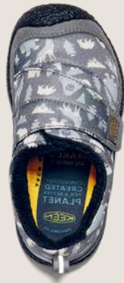
Kids' Howser Wrap | $70 Steel Grey/Star White

Tentside, bedside, TSA side, mountainside, Eastside.