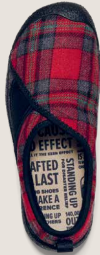
Women's Howser Wrap | $100 Red Plaid/Black