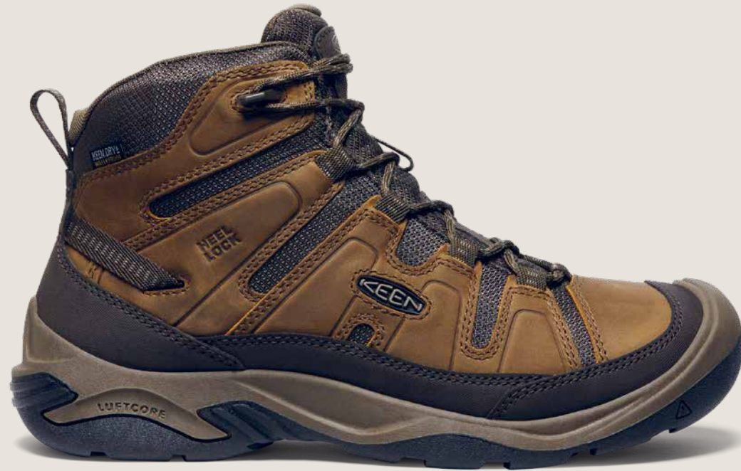
Men's Circadia Waterproof | $145 Bison/Brindle