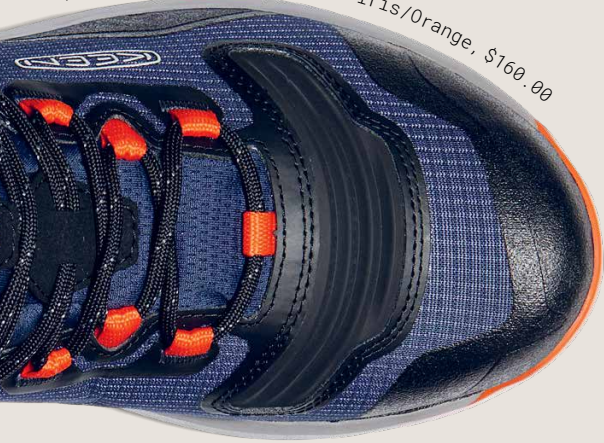
Men's Tempo Flex Mid, Black Iris/Orange, $160.00