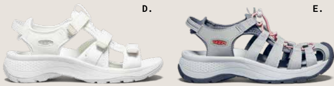
D. Astoria West Open Toe, White, $110.00 / E. Astoria West Sandal, Grey/Coral, $115.00