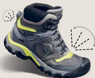
Men's Ridge Flex Mid Steel Grey/Evening Primrose $170.00