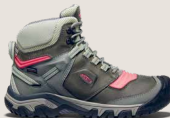
Women's Ridge Flex Mid Castor Grey/Dubarry $170.00