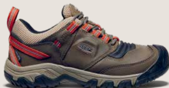
Men's Ridge Flex Timberwolf/Ketchup $160.00