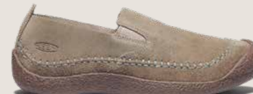
Men's Howser Suede Slip-On, Timberwolf/Chestnut