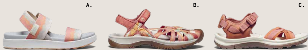
A. Elle Backstrap, Brick Dust/Vapor, $80.00 / B. Rose Sandal, Brick Dust/Multi, $90.00 C. Terradora II Strappy, Redwood/Pheasant, $95.00