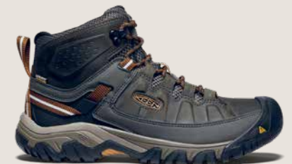
Men's Targhee III Mid, Black/Olive