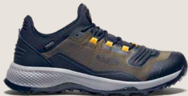
Men's Tempo Flex, Dark Olive/Black