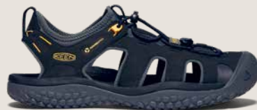
Men's SOLR, Black/Gold