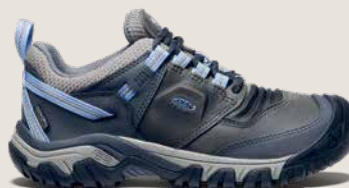
Women's Ridge Flex Steel Grey/Hydrangea $160.00