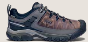
Men's Targhee III, Bungee Cord/Black, $165