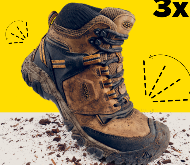
Men's Ridge Flex Mid, Bison/Golden Brown $190