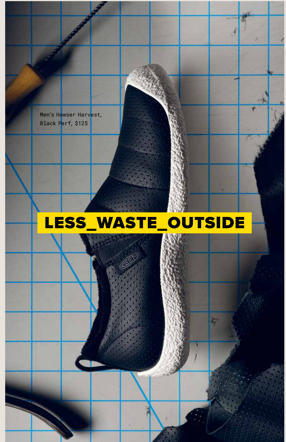
Men's Howser Harvest, Black Perf, $125