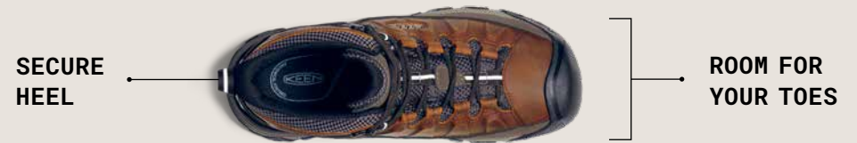
Men's Targhee III Mid, Chestnut/Mulch, $175