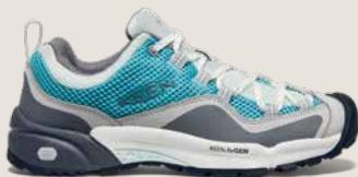
Women's Wasatch Crest Vent, Porcelain/Blue Glass

OUR CAMPMOBILE LIFE. THE DOG DAYS, STARRY NIGHTS, SMILES. SUMMER MEANT TO BE.