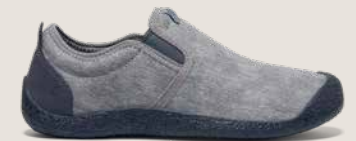
Men's Howser Canvas Slip-On, Steel Grey/Magnet