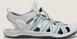
Women's Drift Creek H2, Vapor/Porcelain