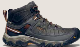
Men's Targhee III Mid, Black Olive/Golden Brown