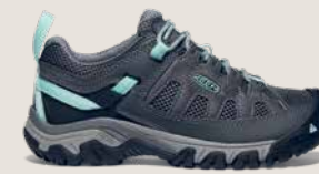
Women's Targhee Vent, Steel Grey/Ocean Wave, $155