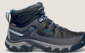
Women's Targhee III Mid, Magnet/Atlantic Blue, $175